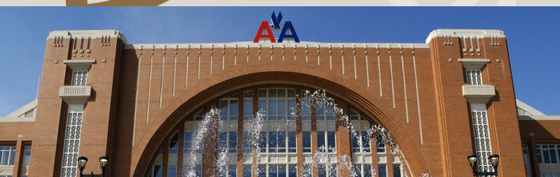
AMERICAN AIRLINES CENTER

Set within Victory Park, The Victor's address presents a walkable selection of eateries, retail corridors and entertainment offerings, including Mesero, Cook Hall, Billy Can Can, Hero, Jinya Ramen, Cinépolis, the American Airlines Center and House of Blues — all waiting to be explored. The dynamic neighborhood lies near key thoroughfares, Interstate 30, Interstate 35 and U.S. Route 75, positioning The Victor's residents just moments from the city's celebrated cultural, social and business districts, such as the Dallas Arts District, the Design District and Downtown Dallas.