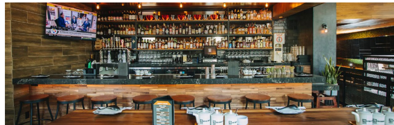
JINYA RAMEN BAR