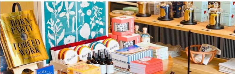
READ BETWEEN THE LINES